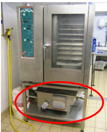
Works great for Combi Ovens too!